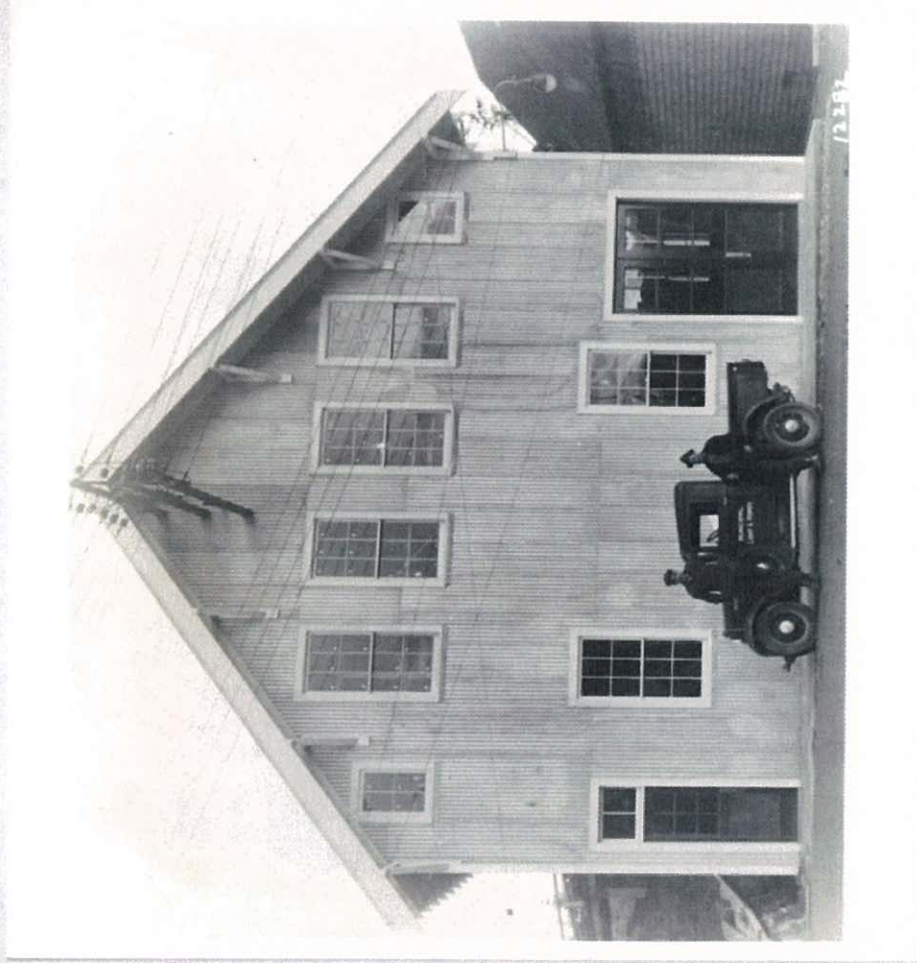
PMPL HEADQUARTERS BUILDING