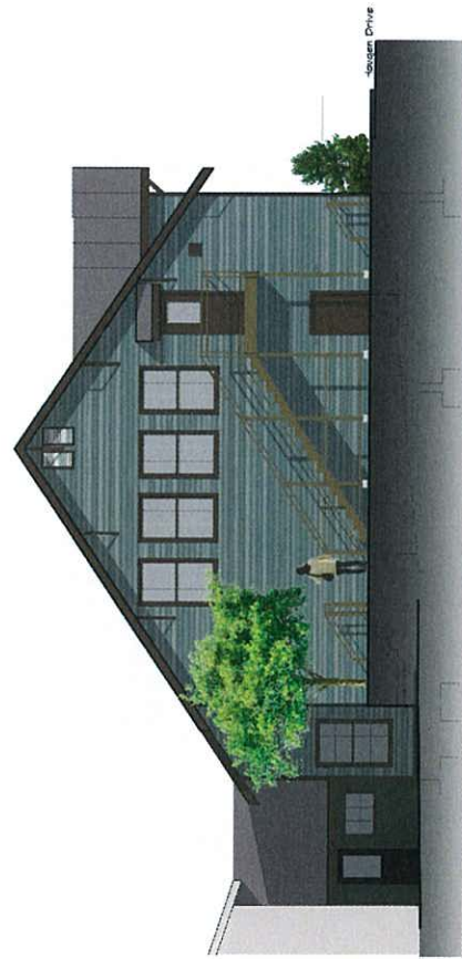
Petersburg Power & Light Building Renovation East Elevation Millard+Associates Architects LLC 4.20.15